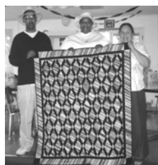
Members display quilt at Summerfest celebration

This year's 22nd annual Raffle went global as we sold raffle tickets on the internet for the first time. This made it easy for friends and family from all over the country to join in the fun. In keeping with the global theme, the first