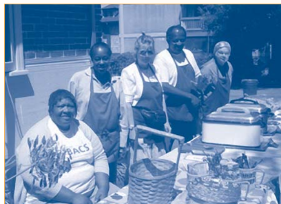
Towne House members ready for action

Sponsored by the Kiwanis Club of Fremont, the Ducks for Bucks Benefit Race helps nonprofit organizations raise funds by selling ducks for prizes. This year South County CLC raised $866, which will be used for supplies and outings for the CLC.