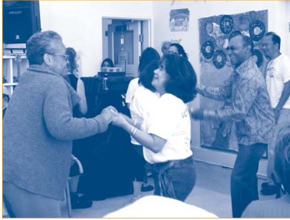
Seniors swinging at a Week of Caring

Here is a glimpse of some upcoming events and of the exciting activities that have taken place at BACS.